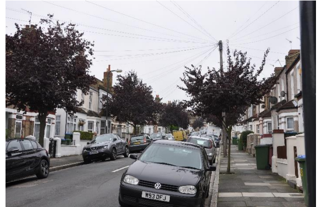
Figure 4 Liffler Rd Plumstead