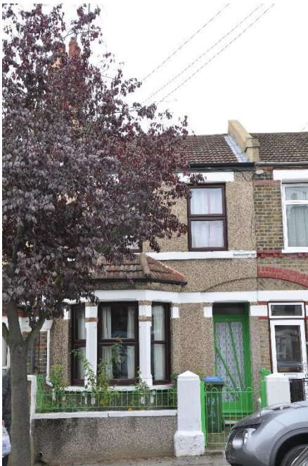
Figure 3 House # 11