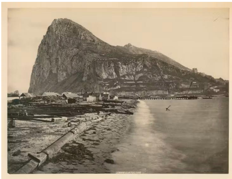
Figure 1 Gibraltar 1870